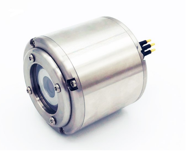
OTAQ Eagle IP™ Cameras deliver an incredible blend of high performance specifications and features in a cost effective package.

Class leading low light colour optics are the key to the superb HD image that our camera produces. The camera is available as either a fixed focus (F) or 18x optical zoom (Z) model with all models having up to 1080P resolution and light sensitivity as low as 0.001 lux. Eagle IP^{TM} cameras are available in a wide range of depth ratings from 300m to 6000m and materials including acetal, anodised aluminium and stainless steel.