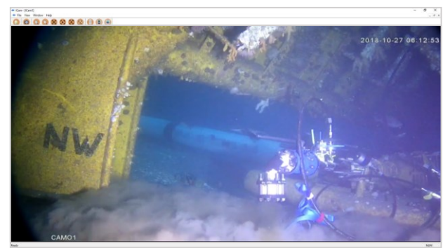
IP camera running at 720P to reduce bandwidth and storage requirement